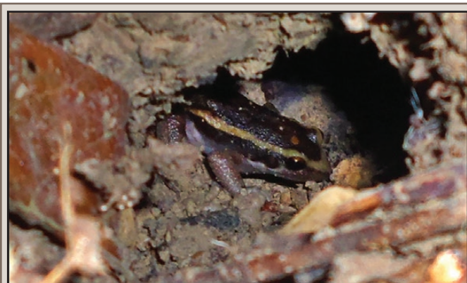
FIG. 1. An adult male Lithodytes lineatus inside an active nest of the leaf cutting ant Atta laevigata .