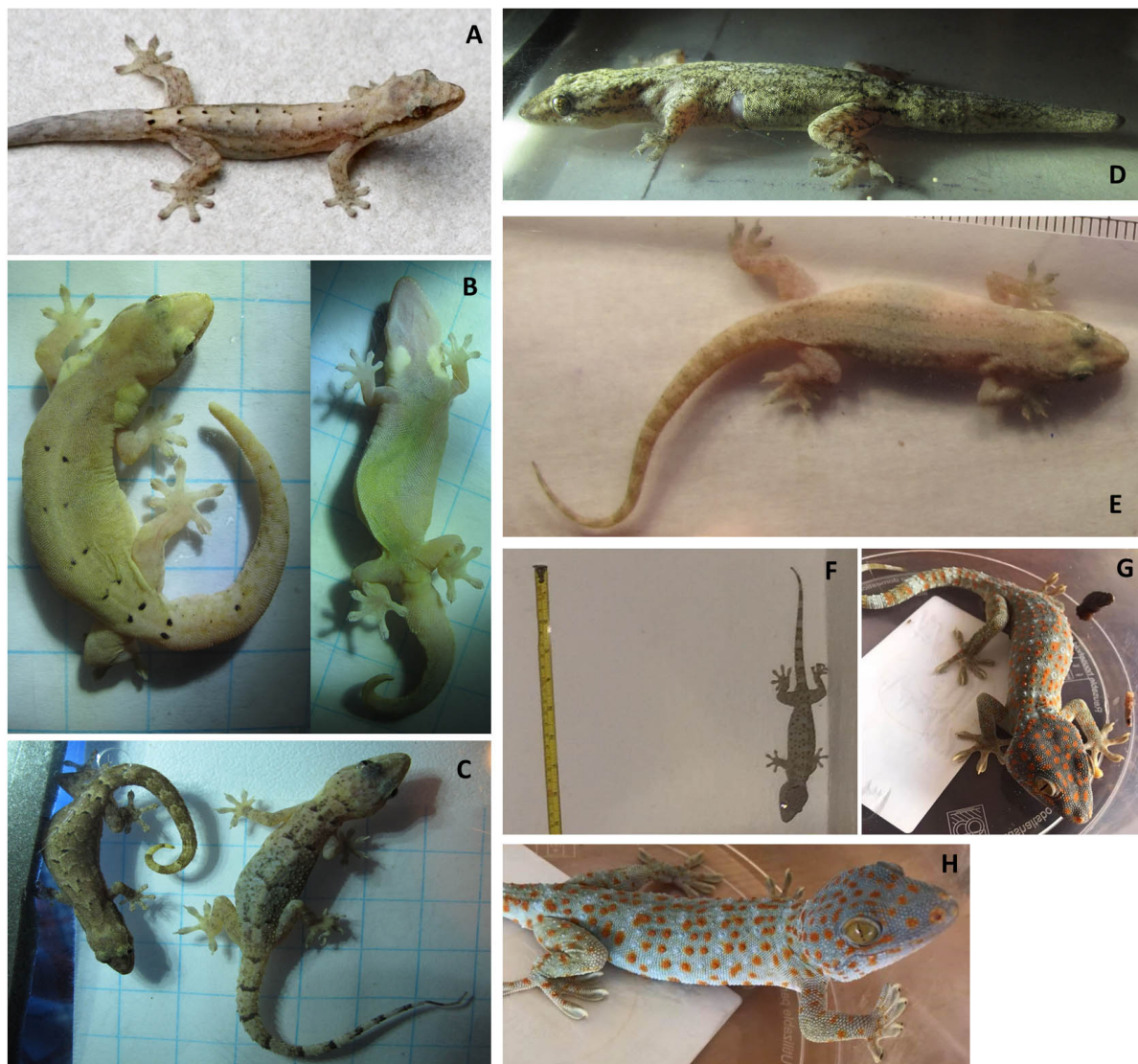
Figure 1. A. L. lugubris from a private residence in Jan Sofat in 2009 (photo: G. van Buurt); B. Dorsal and ventral views of L. lugubris (HEMA-CU11) with well-developed endolymphatic chalk sacs (neck) (photo: M.R. Helmus); C. L. lugubris (left; HEMA-CU28) and H. mabouia (right) side-by-side (photo: M.R. Helmus); D. H. frenatus (HEMA-UR29) with dark dorsal pattern (photo: M.R. Helmus); E. H. frenatus (HEMA-GU57) with light dorsal pattern (photo: T.J. Tran); F. G. gecko on an outdoor wall with tape measure for scale (photo: Savine Boersma); G., H. G. gecko captured at private residence in Santa Catharina (photo: S. Boersma). Photograph locality information is in Table 1.

unknown species in the field, and our DNA analyses confirmed they were H. frenatus (Table 1). We first encountered three adult H. frenatus (HEMA-UR29, LELU-UR05, UR06; Figure 1B) on a metal fence in an overgrown garden area behind the Curaçao Zoo. We then found two adult H. frenatus (HEMA-UR68, UR69) on an outdoor wall behind a framed piece of art at a private residence in close proximity to the Curaçao Zoo. Finally, we found three adult H. frenatus (HEMA-GU57, GU58, GU59; Figure 1C) on a concrete